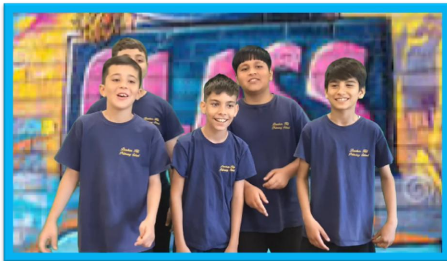
Year 6 children performing their rap.