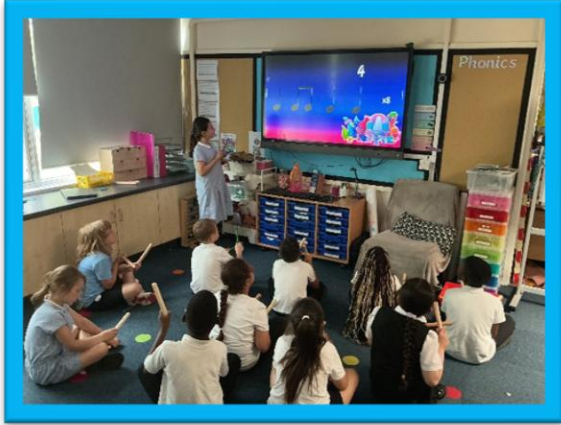
Reception children playing instruments along to their favourite songs.

We celebrated World Music Day across school. Children were tasked with the Breckon Hill Big Music Quiz which each class completed on SeeSaw. Staff could also choose a musical activity to complete with their class. Year 6 children were rewarded with ice lollies for their amazing rap about their time at Breckon Hill.