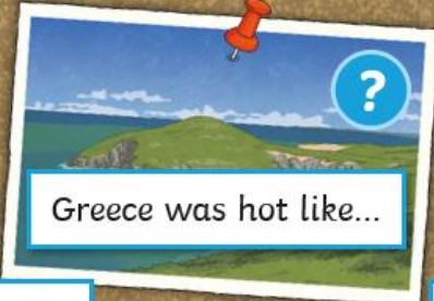
Greece was hot like...