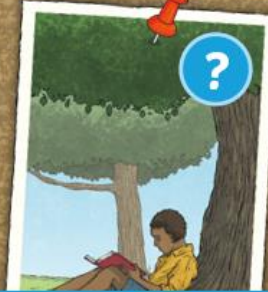
The book was as exciting as...