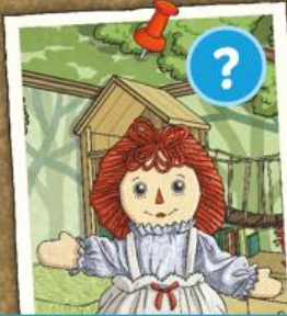
The doll's face was as smooth as...