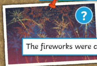
The fireworks were colourful like...