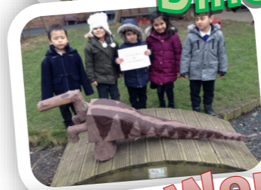
World Book Day