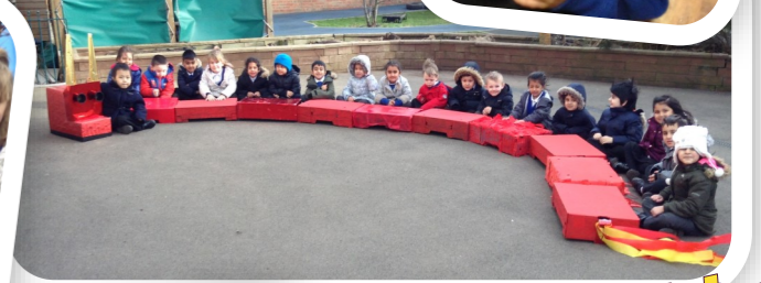
Gas Safety Assembly