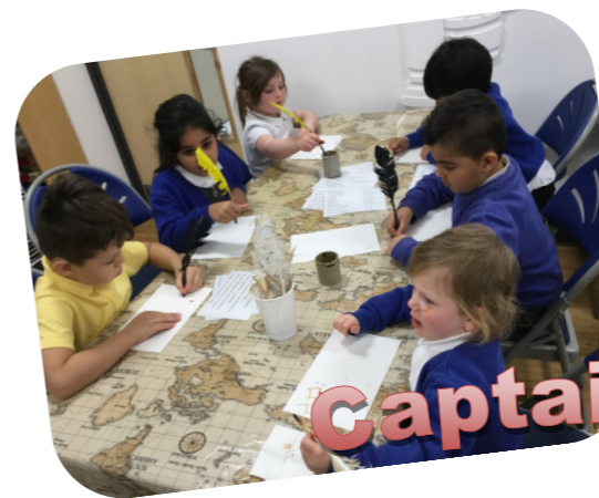
Captain Cook Museum